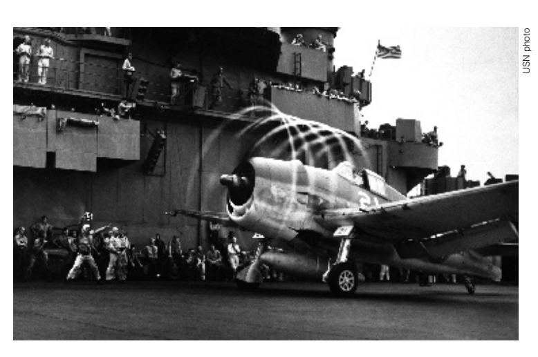
"Aura" forms around prop of Hellcat aboard USS Yorktown.

Achieved astounding 19:1 victory-to-loss ratio ★ flown by 305 aces, most of any US fighter in World War II ★ nicknamed "the Ace Maker" ★ 605 Hellcats produced in a single month (March 1945) ★ flown by Britain, France, Argentina, Paraguay, and Uruguay ★ briefly equipped Blue Angels after World War II.